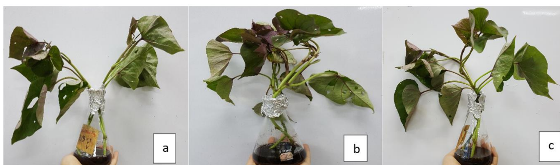
FIGURE 1. Sweet potato cuttings soaked in PGPR-HA formulation for 6 h in (a) UPMB10, (b) UPMRB9, and (c) mixed strain